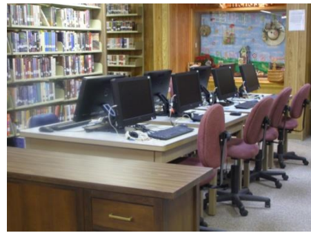
New wireless Computer LAB