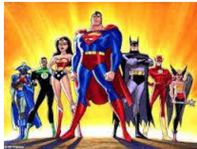
Super heroes are everywhere... Community Heroes are Super Heroes!